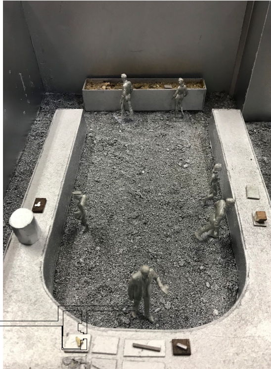
Demonstration and Process of Sand Cast Molding

Reception Party: April 8, 2019 (Mon), 6:00 p.m. - 8:00 p.m.