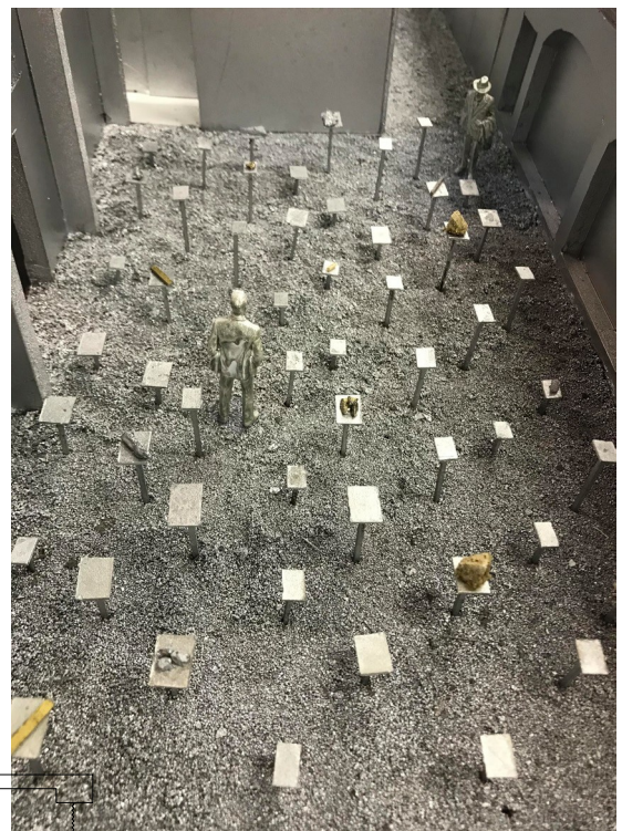
Exhibition of the varied materials and resources used to form handles